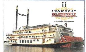
SHOWBOAT BRANSON BELLE