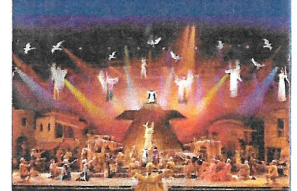
MIRACLE OF CHRISTMAS Show at the Sight & Sound® Theatre