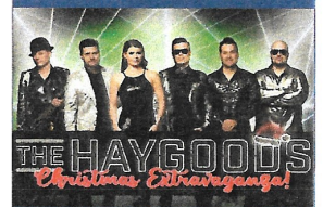
THE HAYGOODS CHRISTMAS SHOW